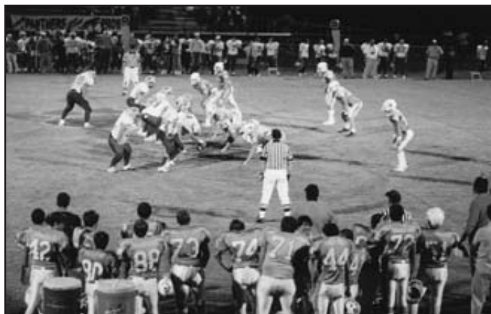
USJ's football team will play in AA classification next season.

Schools playing in Division II are private schools offering financial aid to athletes. Moving to Division II would have meant traveling to Memphis and Nashville for most games.