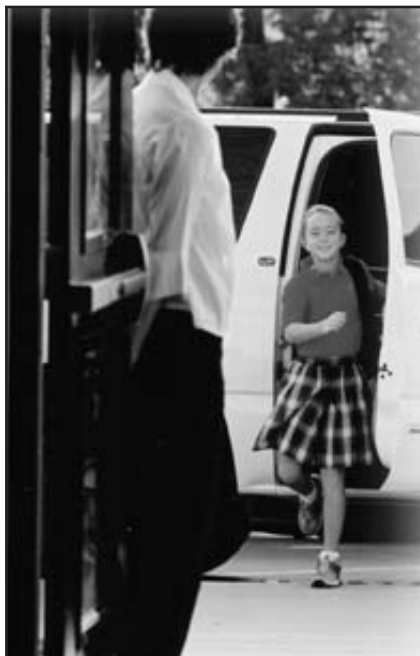
Students come to school dressed for learning.

Besides the new Lower School, the other big news at USJ is the start of uniforms at all grade levels. Students come to school each day looking like they are prepared to learn, administrators say.