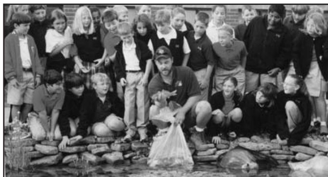
Lower School students are on hand to help stock the pond with koi.

■ USJ has three full-time guidance counselors and two full-time college advisors.